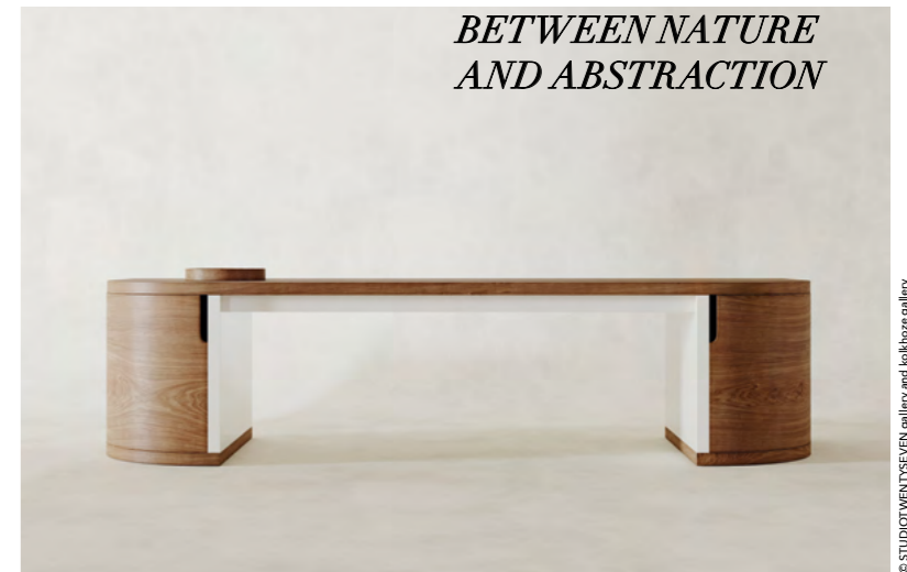
© STUDIO WENTSEVEN gallery and kokkoze gallery Design by FRANCESCO BALZANO